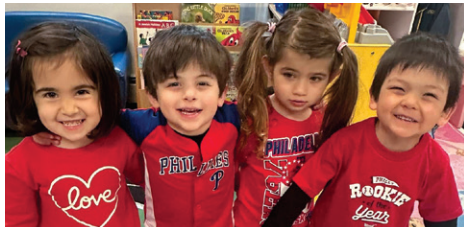
Say Cheese... Just look at these brilliant ECC and Religious School punims!