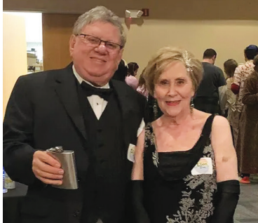
Purim Fun... Our March 23 Purimpalooza Retro Dance Party saw revelers in costumes from so many fun decades! The event for the 'over 21' crowd included a megillah reading, line dancing, and libations! We followed it up the next morning, March 24, with our Kelce/Swift-era Religious School Purim celebration, the "Megillah of Oz" Purim Shpiel, and, finally, we followed the yellow brick road to a Purim Carnival for all ages.