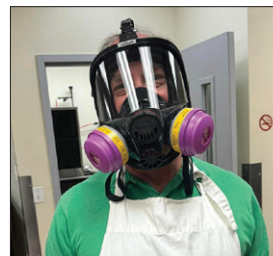
Men's Club's Chrain Gang made it's legendary Passover horseradish once again this spring. It's been "serious" business for over 30 years!

As a first-time synagogue cohort leader, one of the biggest lessons I have learned is that going it alone is never a recipe for success. Jack Welch, former CEO of General Electric, once said, "Before you are a leader, success is all about growing yourself. When you become a leader, success is all about growing others." This is a consistent challenge for me as a leader – asking for help. I am fortunate and grateful to have an amazing Board that is always there when I need them, along with countless others who consistently chip in to help at our various events. In the coming year, it will be a mission of mine to continue to grow this sense of volunteerism that exists within Men's Club and to cultivate the next group of leaders. I appreciate everyone coming on this journey with me and can't wait for what's next.