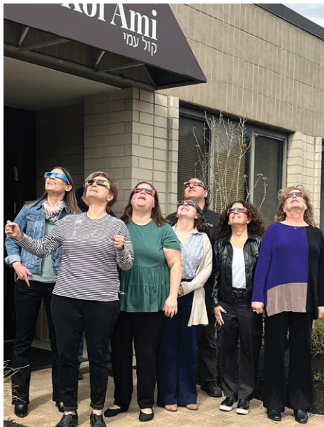
Solar "Flair"... The synagogue staff was "totally" decked out in their solar eclipse glasses as they stepped outside to see the phenomenon on April 8. Not pictured: Ruth Scott (someone had to take the photo!).