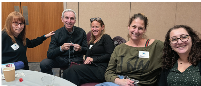
In Stitches... A fun time was had by attendees of our March 27 Spring Stitch. Knitters enjoyed a catered dinner and conversation as they made Caring Caps for donation to area hospitals.